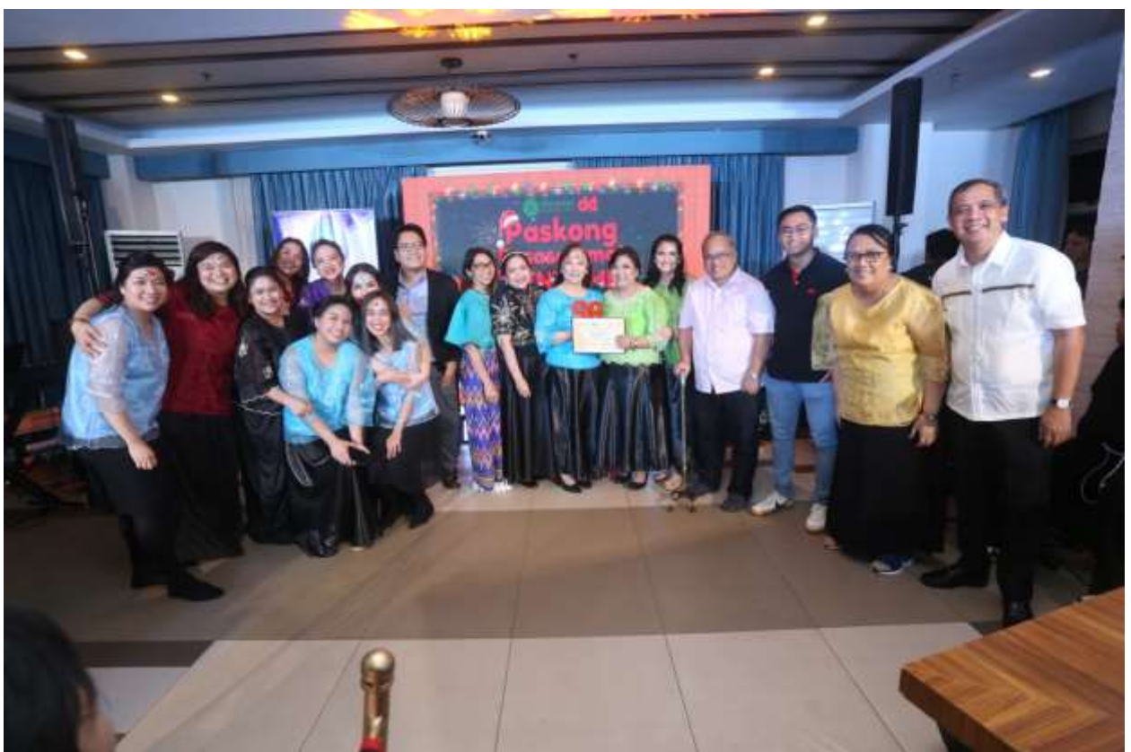
First Place Chorale Winner: Our Lady of Lourdes Hospital