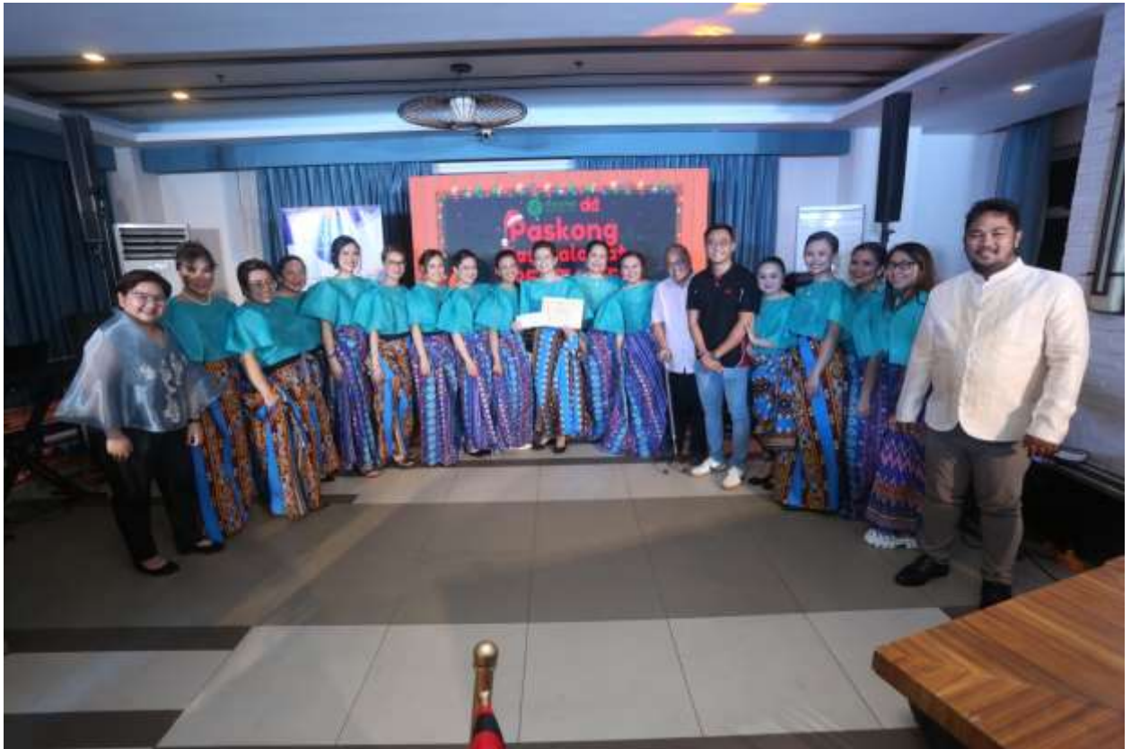
Second Place Chorale Winner: St. Luke's Medical Center-Global