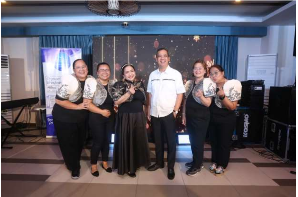
Pentamed Board Members 2023