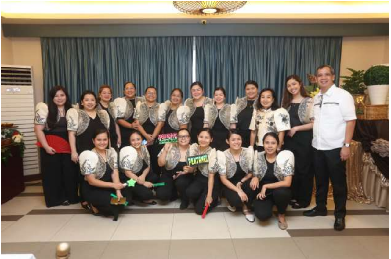
Organizing team: Ospital ng Makati