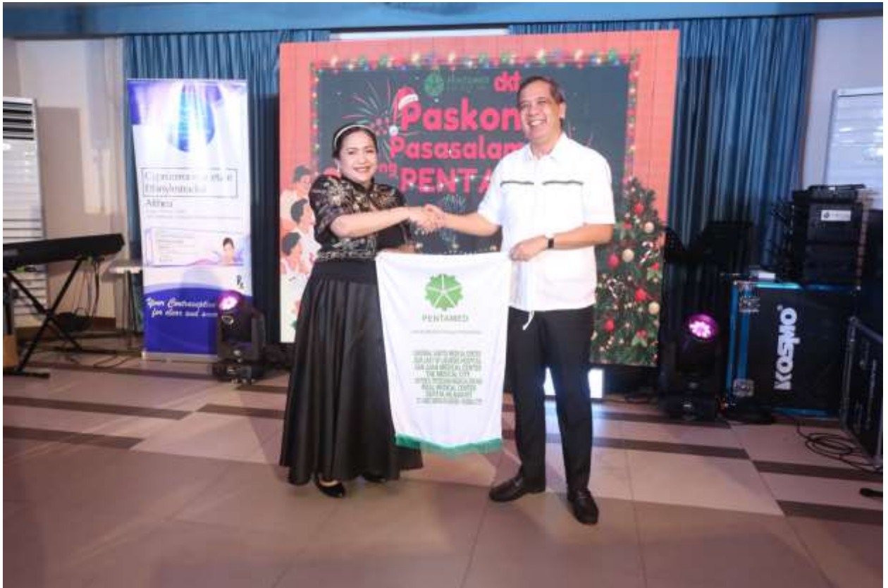
Turnover Ceremony to Rizal Medical Center