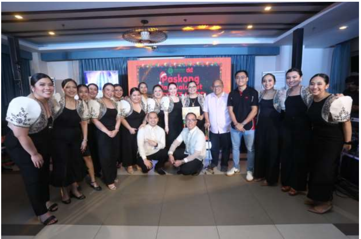
Third Place Chorale Winner: The Medical City